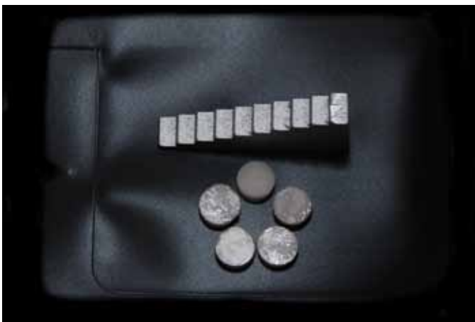
1 Specimen disks with modified step wedge.