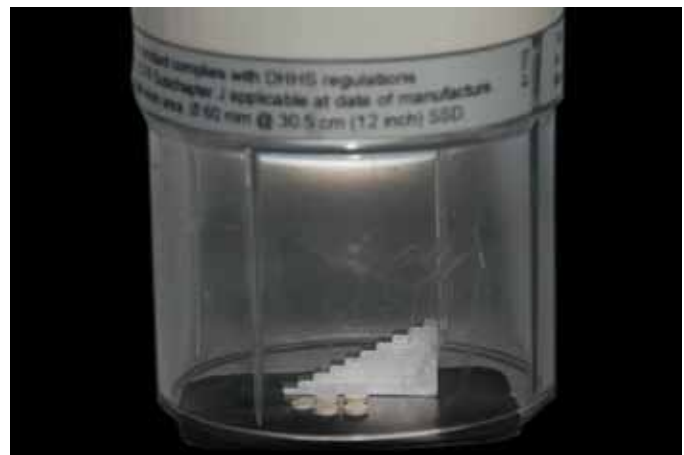
2 Radiographic unit and image plate.

Melville, NY). A 98% pure aluminum step wedge (DHEF, Inc, Taipei, Taiwan) was placed adjacent to the specimens, near the center of the PSP image plate (Fig. 1). The wedge increased in incremental, millimeter-thick steps from 1 mm to 10 mm.